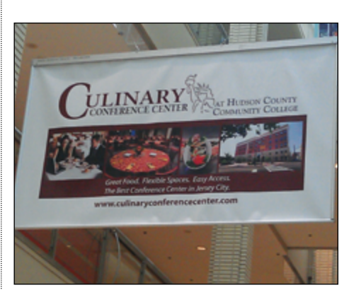
Culinary Conference Center banner on display in Newport Centre Mall, Jersey City, N.J.