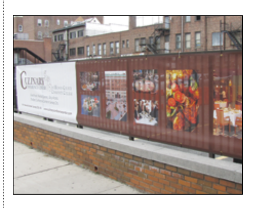
Culinary Conference Center banner on display at 162 Sip Ave., Jersey City, N.J.