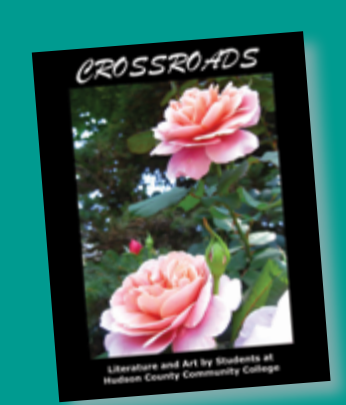
Now available on the MyHudson portal CROSSROADS Arts and Literary Magazine.

Visit CBI on Facebook and Twitter! View upcoming events, look through past events pictures, and get the latest news on training opportunities. "Like" us on Facebook www.facebook.com/cbihudsoncounty, and "Follow" us on Twitter twitter.com/cbihudsoncounty.