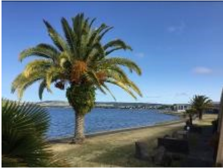
Left - Looking out the front of our Motel room on the shore of Lake Taupo. Right - Huka Falls near Lake Taupo