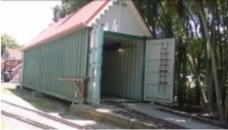
Even a common container can be made to look respectable!