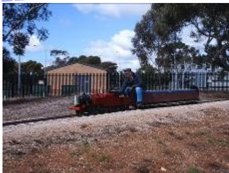
A few shots from 2003