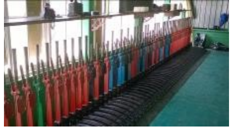
Inside the Frankton Junction South Signal Box.