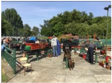
Above—The very busy Steaming Up Bays. Below—five Phantom Locos in action.