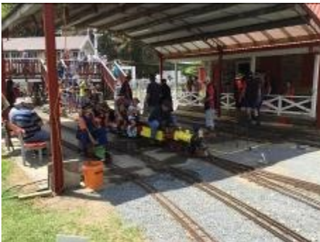
Hamilton Model Engineers Station showing the Frankton Junction South Signal Box. Below - A very good imitation, it even sounded like the real "McCoy".