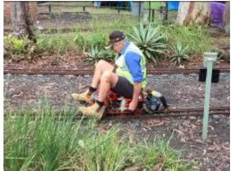
Pine Valley Easter 2019 a little man at the rear pushing a very heavy load.