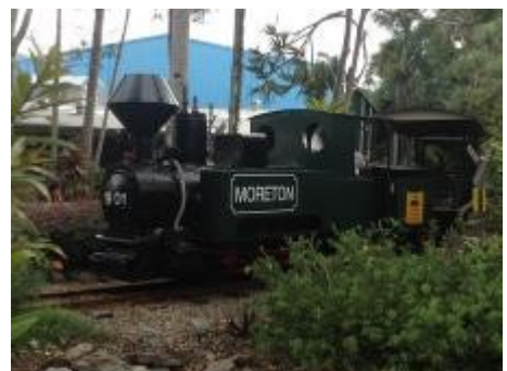
Below - Steam replica Moreton at the Bundaberg Ginger Factory. Easter 2019.