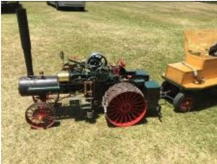
Below - a traction engine and a steam yacht at Hamilton. Trains are not the only attraction at the Steam N' Steel 2020 Convention.