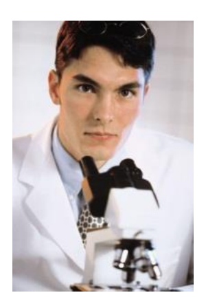
Medical Laboratory Science