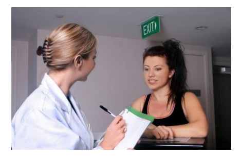
Dietetics and Nutrition