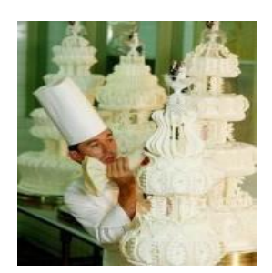
Baking and Pastry Arts