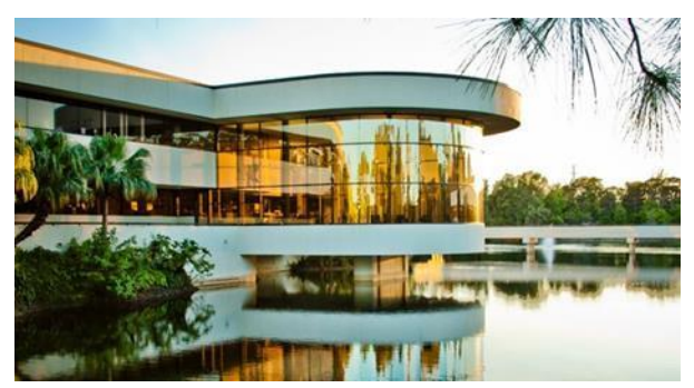
Keiser University Flagship Residential Campus

Keiser University's Flagship Campus is located at 2600 North Military Trail in West Palm Beach, on a 100-acre site with 263,968 square feet of buildings. The Flagship Campus offers students suiterstyle residence halls with meal plans, 24-hour security, Wi-Fi and cable access, and maintains facilities to support 20 NAIA athletic teams, club sports, and intramural activities. All equipment used at Keiser University meets industry standards and program requirements.