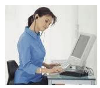
Medical Administrative Billing and Coding