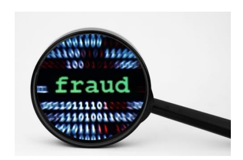
Financial Crime Investigation