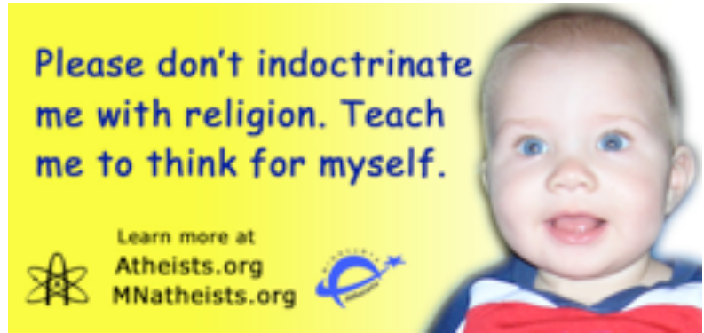
Above: Proposed design; may be modified.

If there is any money left in the Billboard Fund after we have collected enough money it will either be invested in future billboards or be moved to our General Fund.