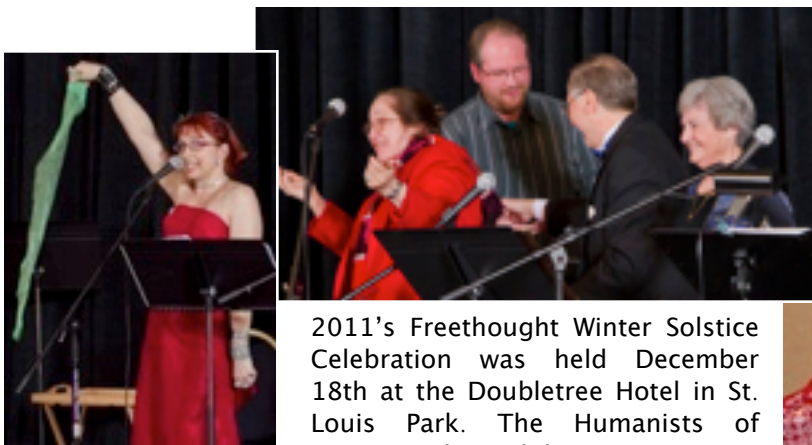
2011's Freethought Winter Solstice Celebration was held December 18th at the Doubletree Hotel in St. Louis Park. The Humanists of Minnesota hosted the event.