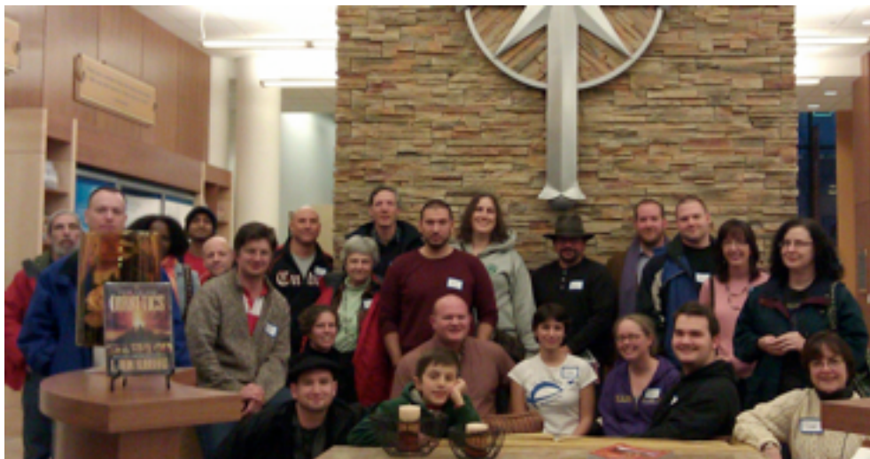
Above: Our group in the main gallery. Note the bottom half of the Scientology 8-point cross in the background. The book on display is Hubbard’s Dianetics.

during the week and, as previously mentioned, the chapel is open to the public every Sunday at 11:00 for a morning service.