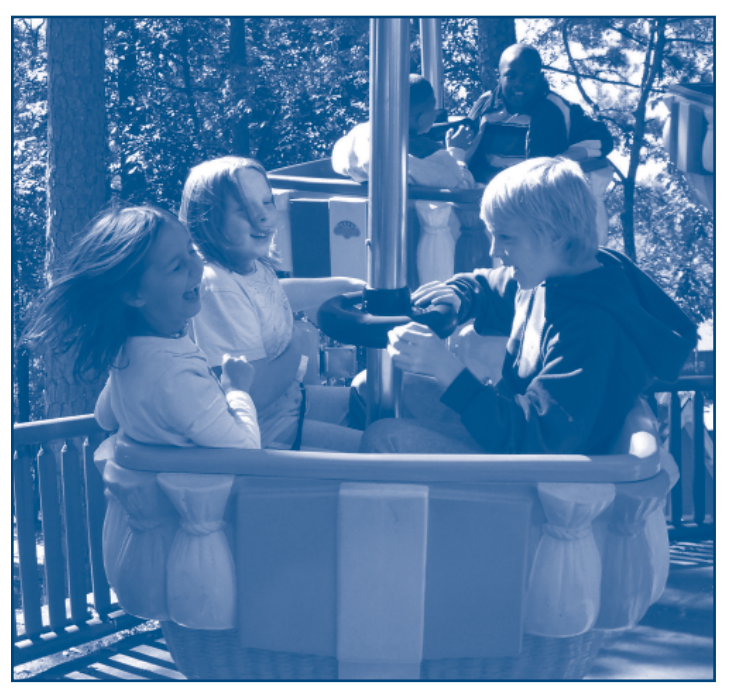
Field Trip Fun - Club members enjoyed a field trip to Magic Springs in late October.