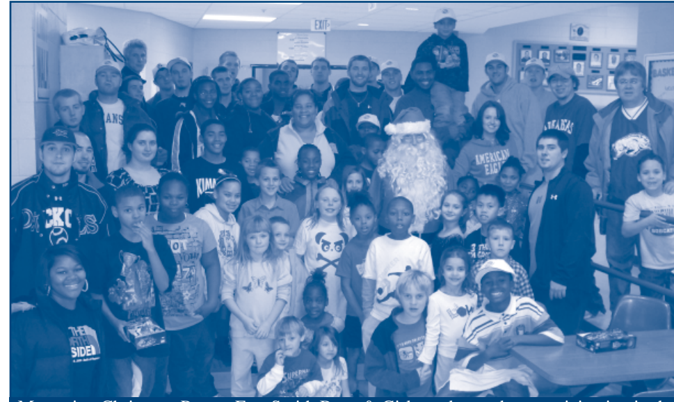
Mentoring Christmas Party - Fort Smith Boys & Girls ccub members participating in the Lean on Me mentoring program were treated to a special holiday party with Santa Claus. Mentors and Club members received a special gift at the event.