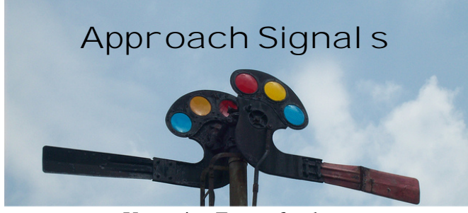
Upcoming Events for the