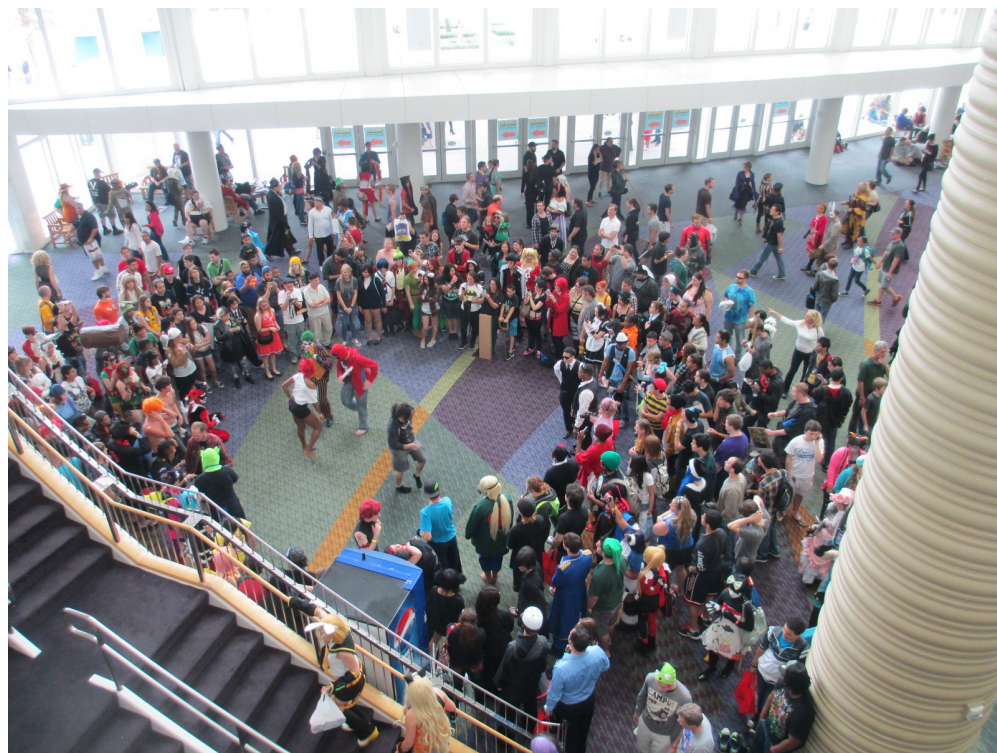
Bottom Row: Improvised dance at Megacon.