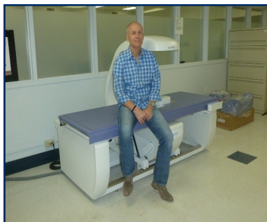
ESHP new DEXA machine