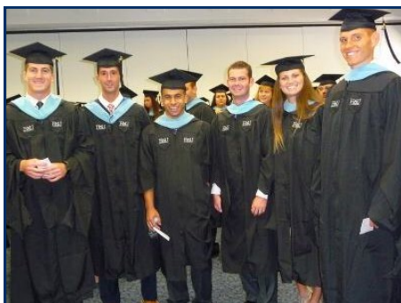
Graduation, Fall 2012