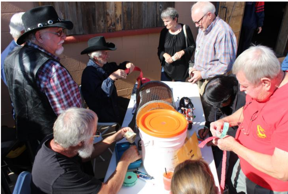
(left) Members buying those last minute “lucky” tickets for the raffles!