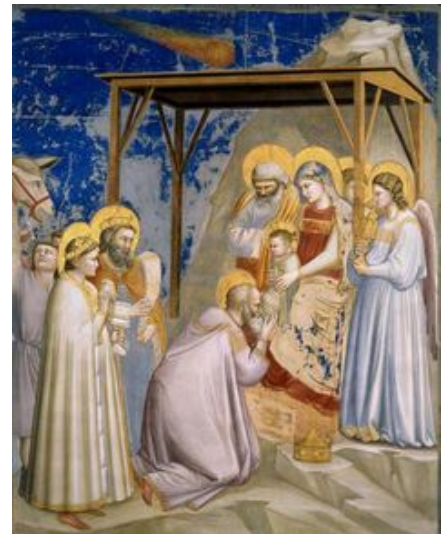
The Adoration of the Magi - Giotto di Bondone, 1305 Arena Chapel in Padua, Italy

With the children's families and Senior Choir at both services, parking will be tight. Those who are blessed with the ability to walk are asked to park in the lot to the east of the church.