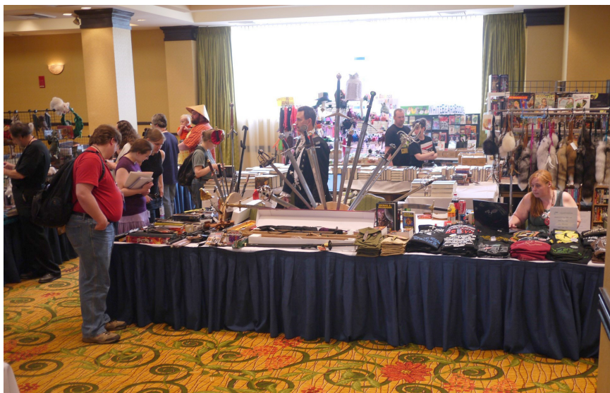
(Above): Dealer room. (Below) Star Wars storm troopers in the lobby of the Marriot.