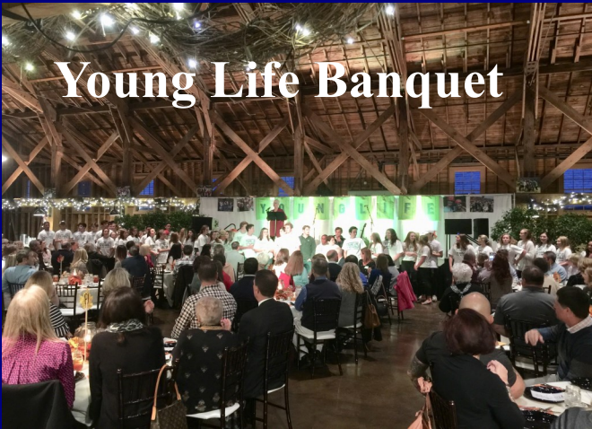
Young Life Banquet