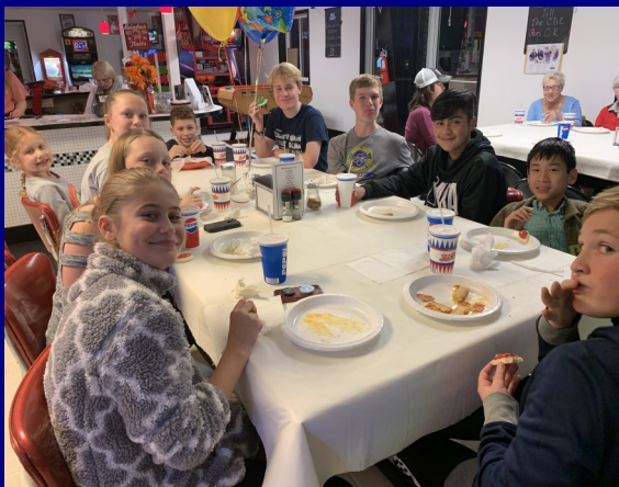
Youth Night Out