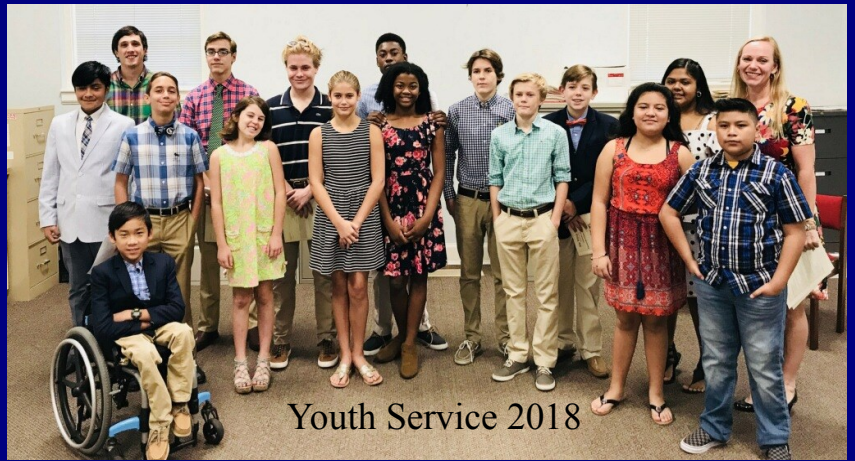
Youth Service 2018