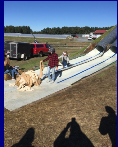
Fun Day at Gross Farms