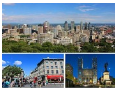
Montreal - City in Québec, Canada