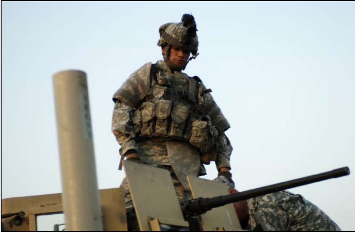
A gunner with Alpha Battery, 1-299th Cavalry of the 29th IBCT prepares his mounted weapon in preparation for their first solo convoy mission in support of the Wranglers.