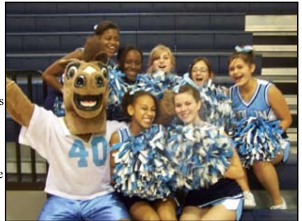
The Nolan Middle School 6th - 8th grades pep rally during Veterans Day Celebration.

He called the young people to serve their Nation in any way they can.