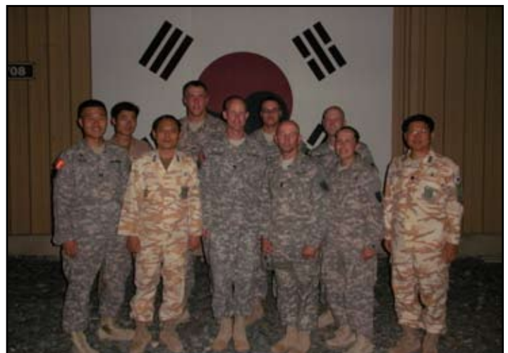
Members of the 6th Transportation Battalion and 58th Airlift Wing Commands pose together for a group picture in front of the South Korean Flag at LSA.

This visit went beyond our expectations. For about three hours, we were treated to a mission briefing, a C-130 aircraft tour and