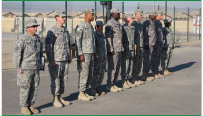
Soldiers of the 846th Transportation Company are presented Certificates of Achievement at Camp Arifjan. The Soldiers' commitment to mission success has lead to an exciting and successful deployment for the Road Dawgs.