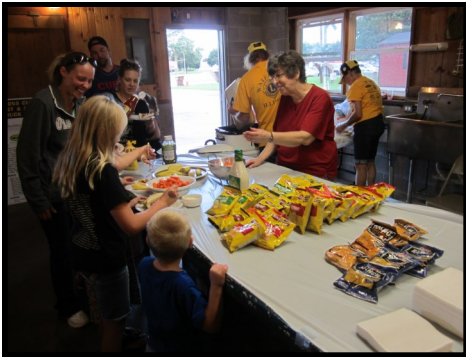
Waterman area children enjoyed hot dogs, bananas, carrots and chips at the Waterman Lions Club end-of- summer/back-to-school picnic.