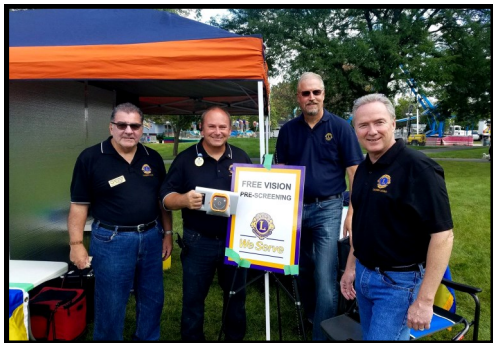
Darien Lions Club held a Free Vision Pre-Screening on September 10 th at Darien Community Park during Darienfest. Five cameras were purchased — one for each of the five regions of District 1-J. Training in how to use them is made available to Lions in each of the regions.