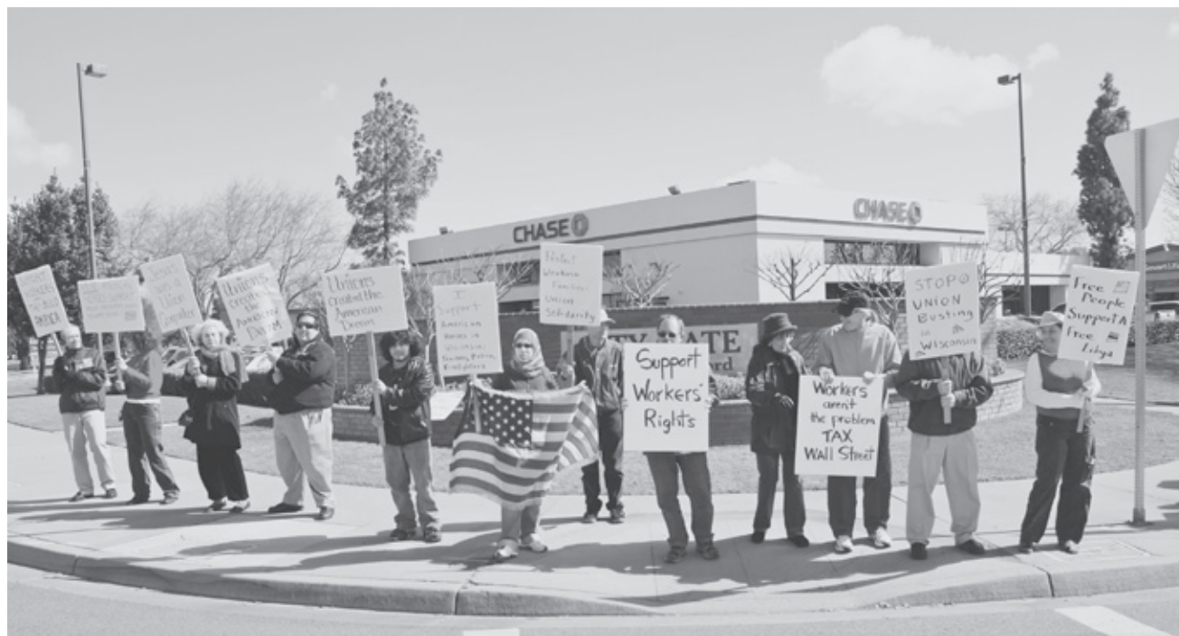
Valley Progressives and Peace Center members vigil in solidarity with union workers and the people of Libya on February 26.