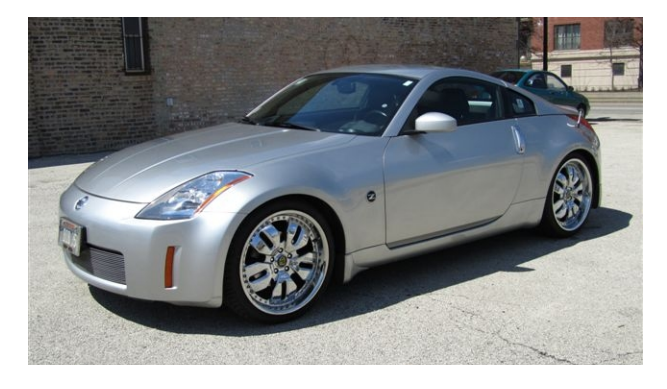
Price $18,000 or Best Offer Like new car with used-car price!

2003 350Z Touring Silver with black interior in excellent condition with 20000 Miles. It has never being out in the snow and have kept it in the garage. 3.5 engine, 6 cylinder, automatic and stick transmission.