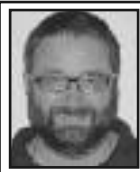
Rick A. Elina

Thomas Edison once said, "Genius is 1 per cent inspiration and 99 per cent perspiration." The reverse, however, might be said about writer/director Chris King, a man whose genius is 100 per cent inspiration from the highest order. Mime-Cert is inspired storytelling in a unique fashion. This expansive theatrical medium involves not only acting but also incorporates mime and music to complement the performance. The resulting mime