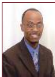
Ramon Hodridge, Minister

www.nmzb.org (Website) • newmzbc@aol.com (Email)