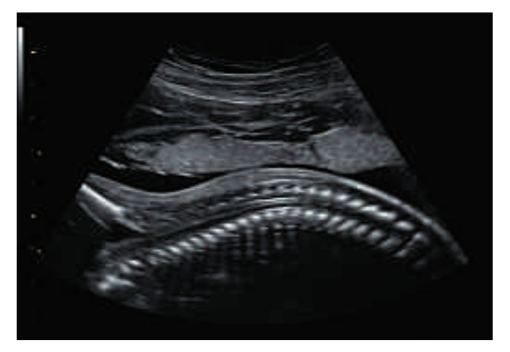
CrossXBeam <sup>cRI™</sup> helps enhance tissue interfaces and border differentiation.