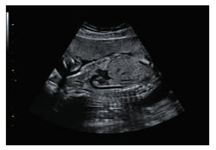
Advanced SRI (Speckle Reduction Imaging) helps reduce intrinsic artifacts to improve visualization and contrast resolution.