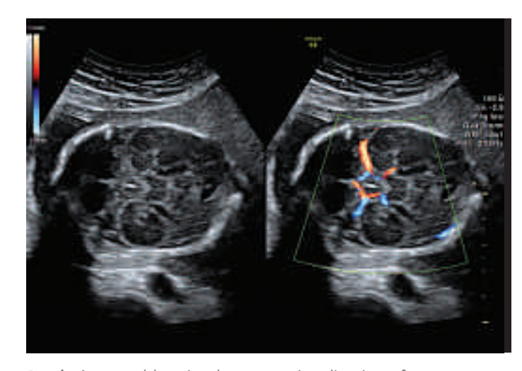
Dual-view enables simultaneous visualization of anatomy and blood flow.

Helping you provide excellent patient care