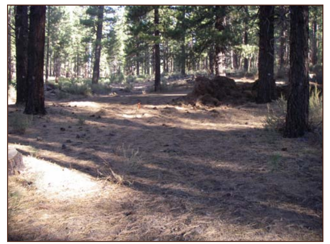
Figure 5. Pre-construction (PPD).