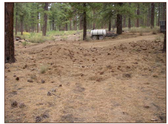
Figure 6. Site post construction (PPB).