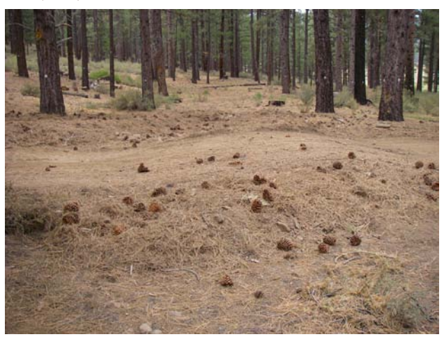
Figure 4. Looking across post construction (PPB).