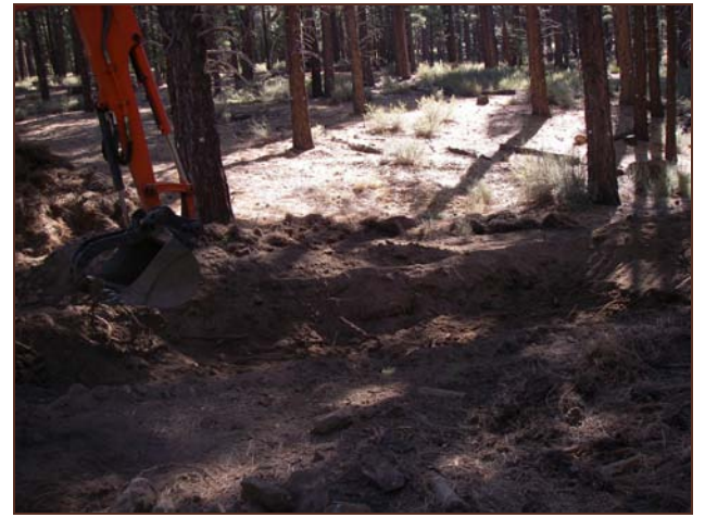
Figure 3. Removing topsoil and shaping basin.