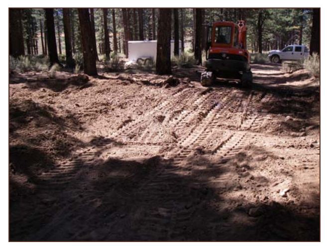
Figure 2. Track packing rolling dip. Basin is on the left (PPC).