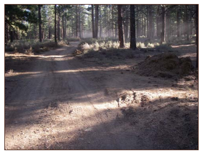
Figure 1. Rolling dip site on Sawmill Flat Road preconstruction (PPA). The basin site is on the right.