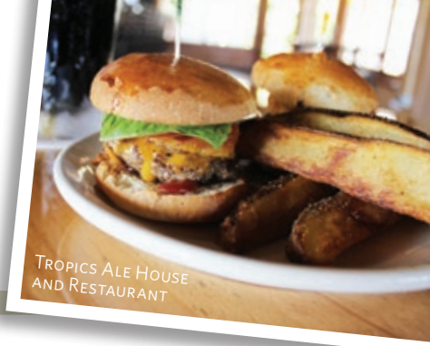
TROPICS ALE HOUSE AND RESTAURANT