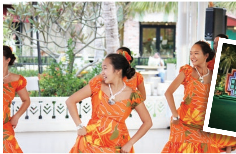
(LEFT TO RIGHT) A HULA TROUPE PERFORMS AT QUEENS’ MARKETPLACE AND WHEEL OF FORTUNE AT HILTON WAIKOLOA VILLAGE.

Each week throughout the resort, numerous activities are offered that spotlight everything from Hawaiian culture — such as hula shows, ‘ukulele lessons,