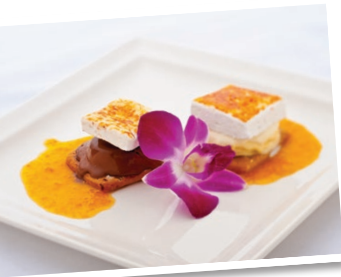
THE HAWAII FOOD & WINE FESTIVAL WAS ONE OF THE HIGHLIGHTS OF 2014 AT WAIKOLOA BEACH RESORT

catalogue of music. You can be sure they'll crank it up with mega-hits "Horse with No Name," "Ventura Highway," "Sister Golden Hair," and many more. This is one of several major concerts sponsored by Waikoloa Beach Resort, which over the past years have also featured marquee names such as Chicago and Earth Wind & Fire.