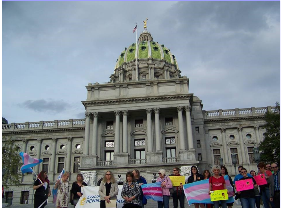
The Annual 'Transgender Day of Visibility' at the steps of the Pennsylvania Capitol on March 31st

The LGBT Center has started offering meet-ups in Lancaster and York for LGBT women, LGBT men, LGBT parents, and LGBT seniors. Each meet-up takes place one Monday each month in Lancaster, and one Wednesday each month in York.