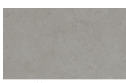
FOG TP36 (3)