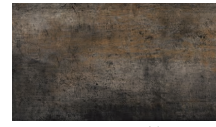
DISTRESSED ZINC TP47 (4)