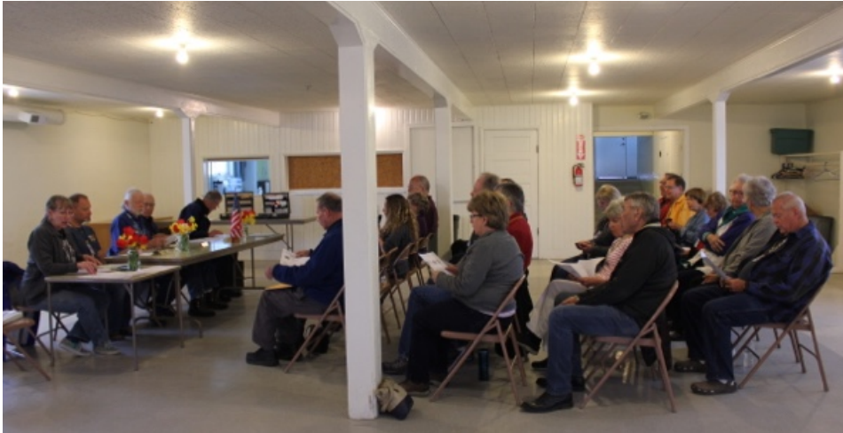
Business Meeting at the Vale Grange Hall