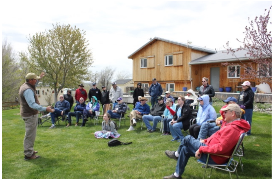
The group enjoying the presentation at Corjo Wildlife Productions... especially Widow, the golden eagle.