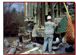
Refurbishment to lift stations