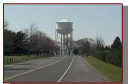
Water Tower Replacement