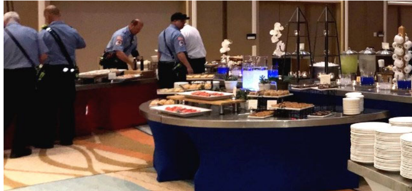
Walt Disney World Swan and Dolphin Resort