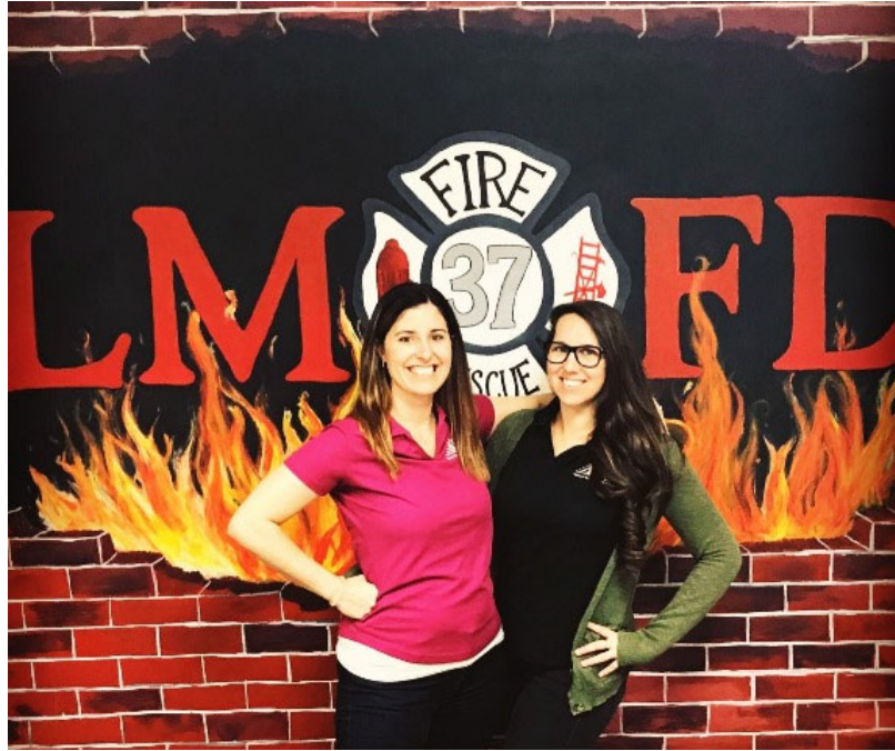
System Tech Services