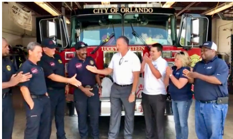
WCA Waste Corporation