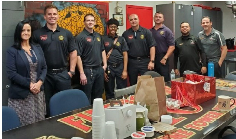
The Point Hotel