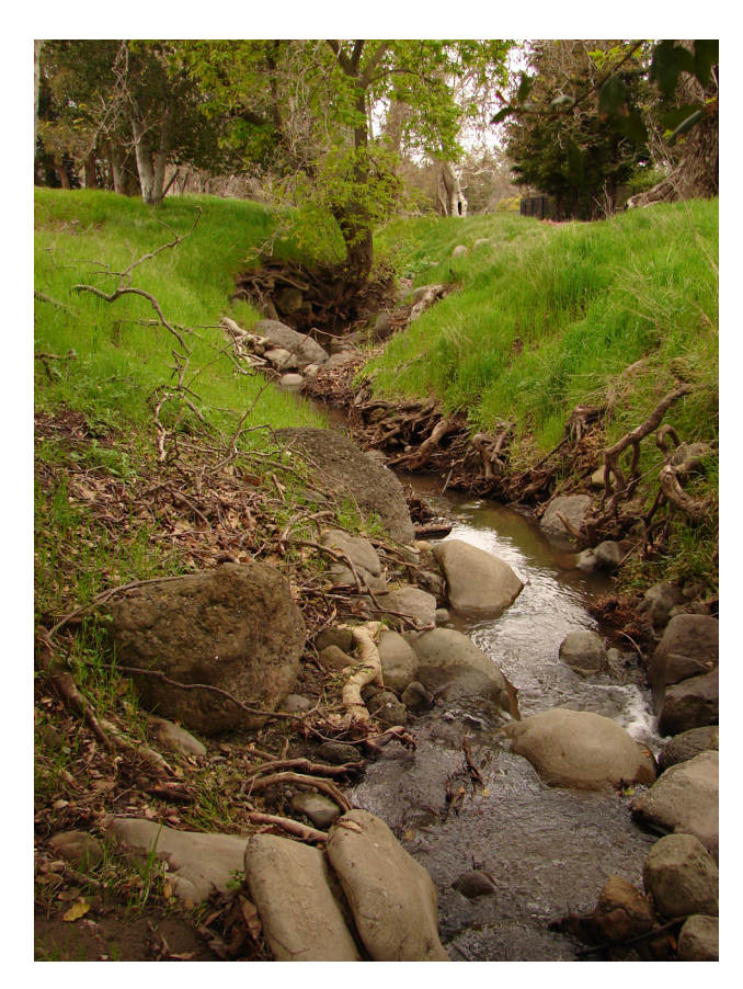
Agua Fria Creek near the Higuera Adobe

The trip had often been difficult and the colonists had endured lack of water and food, life threatening weather conditions, debilitated and dying animals, and roads that often seemed impassable due to rain, mud, sand or snow. At least twice the expedition was hampered by desertion of servants or military personnel. Nonetheless, only one woman died (due to childbirth complications) and four babies were born. Without the help of Native American tribes they met along the way, the expedition may not have been so successful. In June of 1776, the colonists, led by Anza's second in command Lieutenant José Joaquin Moraga, were given permission to continue their journey to the bay of San Francisco and build there the presidio and mission for which the colonists had left their homeland. The expedition then travelled to what is now Mission San Jose and to the hot springs near what is now the Higuera Adobe. Mission San Jose area was nearly flat with lots of year round water, which made it ideal for farming and the Higuera Adobe site was ideal for defensive purposes. From the Higuera site they could see all the way across the bay and nearly to the Golden Gate for approaching ships. It was about 20-years later that Mission San Jose was founded and nearly 50-years later that the Higuera Adobe was built.