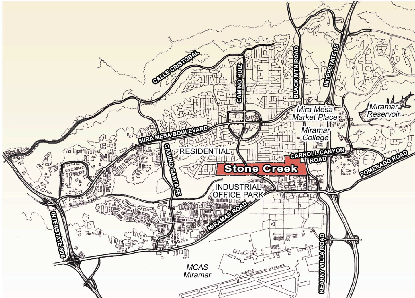
Figure 1 Stone Creek Project Location