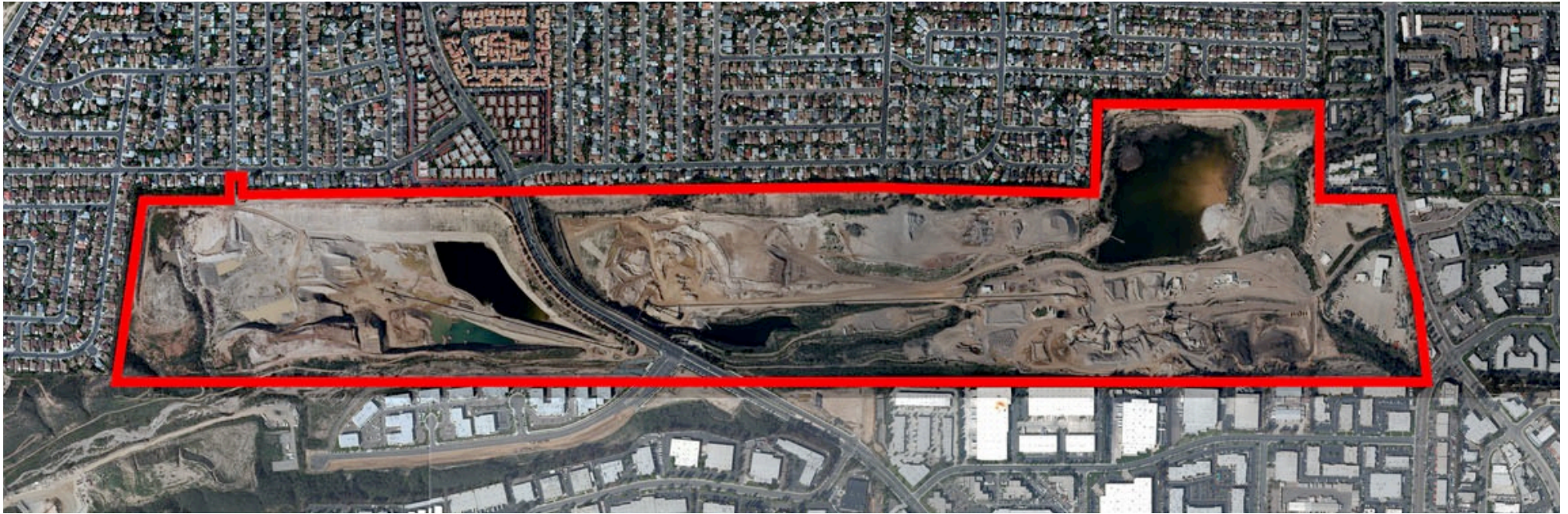
Figure 4 Stone Creek Aerial Photograph