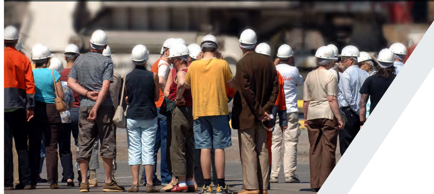
Visiting a working example of the facility being proposed is vital.