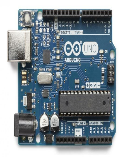
Fig: Arduino uno

d) Arduino Uno: Arduino is a microcontroller board based on the ATmega328P. It has 14 digital input/output pins (of which 6 can be used as PWM outputs), 6 analog inputs, a 16 MHz quartz crystal, a USB connection, a power jack, an ICSP header and a reset button. It contains everything needed to support the microcontroller. Arduino Software (IDE) were the reference versions of Arduino, now evolved to newer releases. The Uno board is the first in a series of USB Arduino boards, and the reference model for the Arduino platform; for an extensive list of current, past or outdated boards see the Arduino index of boards.