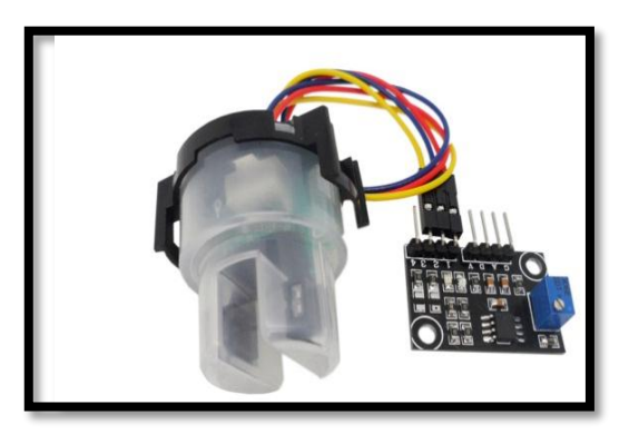
Fig: Turbidity sensor

a) Turbidity sensor: Turbidity is a measure of the cloudiness of water. Turbidity has indicated the degree at which the water loses its transparency. It is considered as a good measure of the quality of water. Turbidity blocks out the light needed by submerged aquatic vegetation. It also can raise surface water temperatures above normal because suspended particles near the surface facilitate the absorption of heat from sunlight.