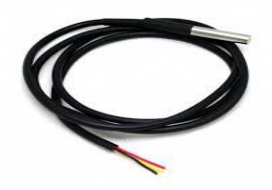
Fig: Temperature sensor

b) Temperature sensor: Water Temperature indicates how water is hot or cold. The range of DS18B20 temperature sensor is -55 to +125 °C. This temperature sensor is digital type which gives accurate reading.