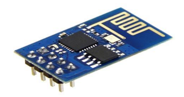
Fig: WiFi module

The ESP8266 WiFi Module is a self contained SOC with integrated TCP/IP protocol stack that can give any microcontroller access to your WiFi network. The ESP8266 is capable of either hosting an application or offloading all Wi-Fi networking functions from another application processor. Each ESP8266 module comes pre-programmed with an AT command set firmware. The ESP8266 module is an extremely cost effective board with a huge, and ever growing, community.