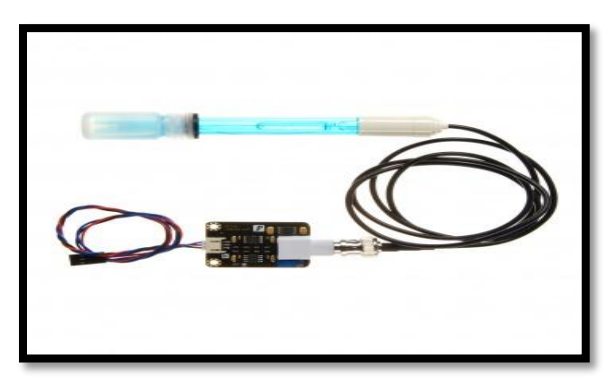
Fig: pH sensor

pH sensor: The pH of a solution is the measure of the acidity or alkalinity of that solution. The pH scale is a logarithmic scale whose range is from 0-14 with a neutral point being 7. Values above 7 indicate a basic or alkaline solution and values below 7 would indicate an acidic solution. It operates on 5V power supply and it is easy to interface with arduino.The normal range of pH is 6 to 8.5.