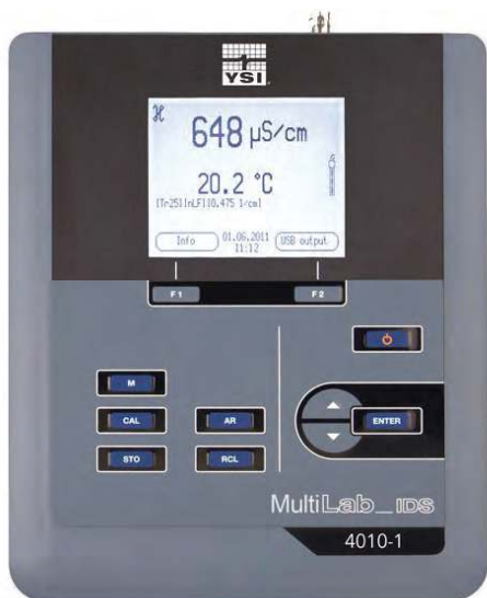
MultiLab 4010-1 Single channel