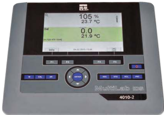
MultiLab 4010-2 Dual channel