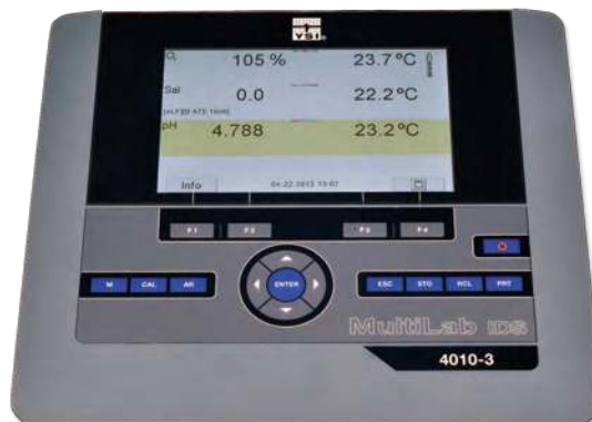
MultiLab 4010-3 Three channel

The YSI MultiLab line includes the 4010-1 (single channel), 4010-2 (dual channel) and 4010-3 (three channel) instruments providing easy-to-use and -calibrate menu-driven operation ideal for the laboratory.