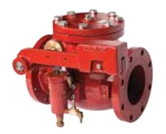
AWWA Series 9001 with Air Cushion