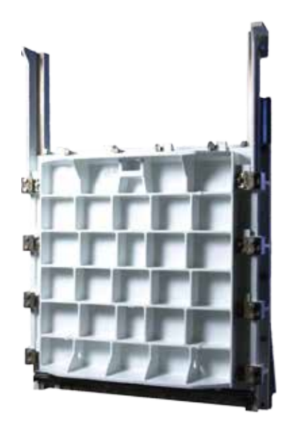
Cast-Iron Penstock Gate