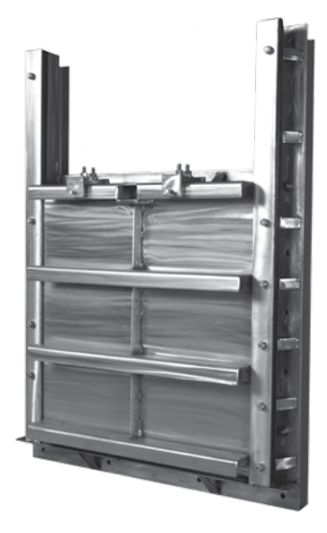
Heavy-Duty Fabricated Slide Gate