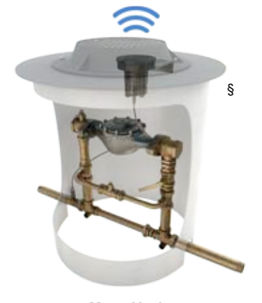
Roadway & Sidewalk Installation