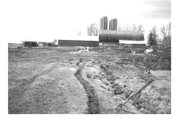
Figure 4. Poor land management practices can greatly increase material (nutrients and sediments) transport to water resources

Changes in tillage practices are designed to protect soil surfaces, particularly during periods of minimal plant coverage, as a means to reduce soil loss due to erosion. Conservation tillage and strip cropping limit the amount of surface tilled, while contour tillage orients tilling and planting along topographic contours to reduce erosion. Contour tilling can reduce soil loss due to erosion by as much as 50 percent (Brach 1991). Strips of closegrowing plants or alternating crop types within the same field can also reduce material losses due to erosion.