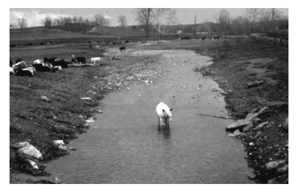
Figure 5. Unlimited animal access to streams increases bank erosion and introduces nutrients and organic matter

IMPLEMENTATION: Watersheds are complex landscapes containing multiple potential sources of materials that can degrade water quality. Understanding linkages between land use, material export, and water quality response is key to designing and implementing an effective watershed management plan. This process will require the acquisition of information describing current conditions in the watershed, the degree of the water resource degradation or potential for impact, and the relative contribution of point and non-point sources to the observed degradation or anticipated impact. Table 4 lists analytical tools and models that are both easy to apply and obtain to assess water quality conditions and to design selected BMPs.