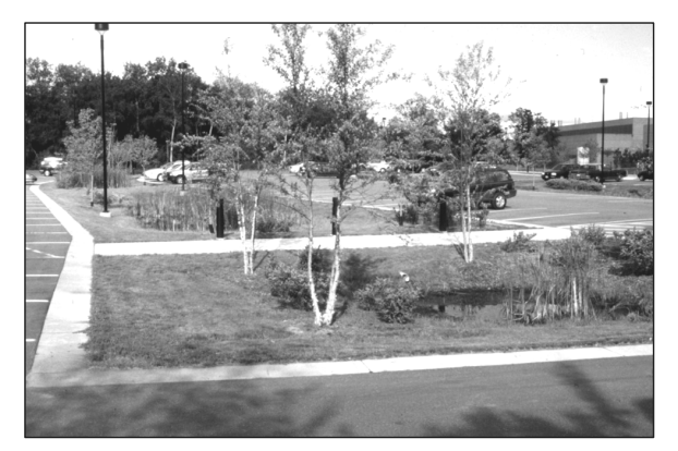
Figure 2. Parking lot designs that limit curbing and incorporate pervious infiltration areas reduce storm water runoff volume and the export of materials to nearby streams

Commonly employed BMPs for urban and residential watersheds are listed and briefly described in Table 2.