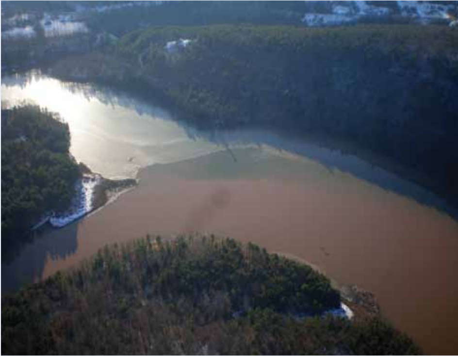
This aerial view of the Schoharie River, four months after the 2011 Irene-Lee flooding, magnifies the lasting impact of soil erosion, sedimentation and turbidity on water quality.

stewardship file that shows any changes for each property. The BDR not only contains photography, property descriptions and observations on the day the property closed; it also holds a survey which documents buildings, use area boundaries along with GIS or other imagery maps that visualize various landscape conditions.