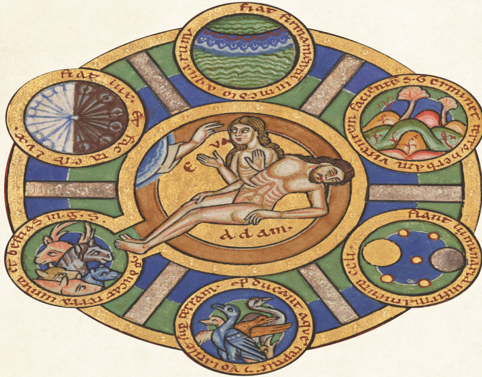
Detail, Anonymous, The Creation of the World , Germany, c. 1170s