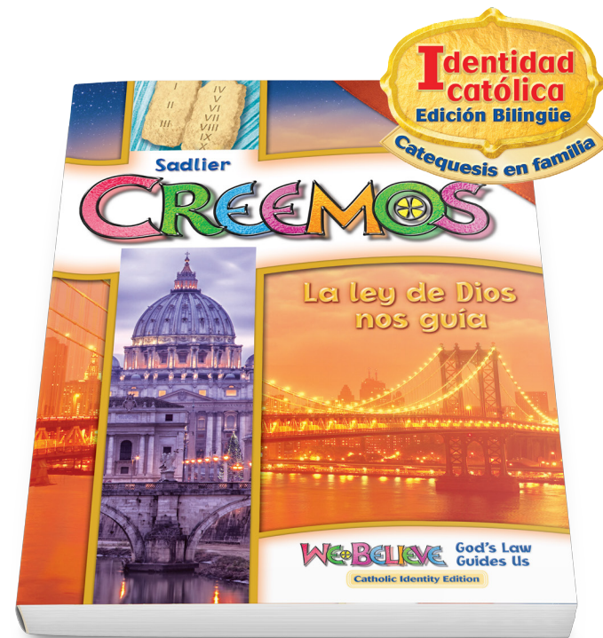
Creemos™ Catholic Identity Edition, Grade 4 • Bilingual