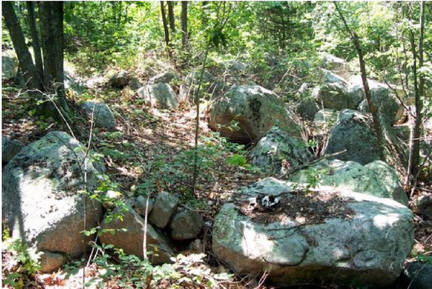
Dogtown in Gloucester Terminal Moraine