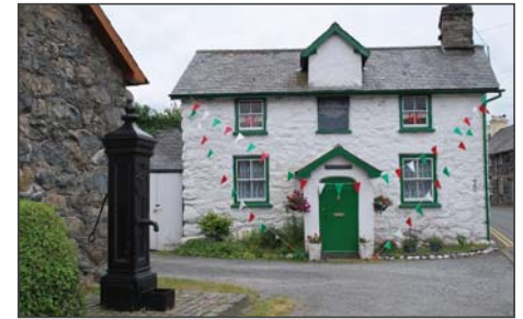
Hen Dy'r Ysgol – The Old School House and village water pump.

This leads to Llanuwchllyn railway station, from where you can enjoy a pleasant lakeside trip on the train back to Bala – if, of course, you didn't opt to leave your car here and take the train to the start of your walk!