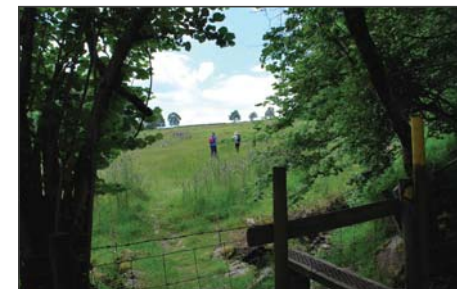
Leaving the woodland, Derek and Llinos walk up through the meadow

Bear left below the trees, along a rather indistinct track up through the heathland. Keeping the fence line on your right, head uphill, eventually bearing right to a brow where views of the Arenig mountains open up ahead. Then bear left around a small outcrop of rock and straight on to reach the rounded summit and trig point.