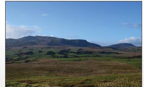
The level heathland of Gwastadros with the Arenig mountains beyond

It's very wet and poor ground to keep livestock, and during the early 1800s this was the only land available for the poor people of the area to graze their animals. Life could often be very hard at that time.