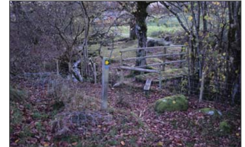
Stile and wooden bridge leading to the farm track

Turn left down this track then right after a metal gate for 100 yards along a vehicle track which leads to the farmhouse of Weirglodd Wen.