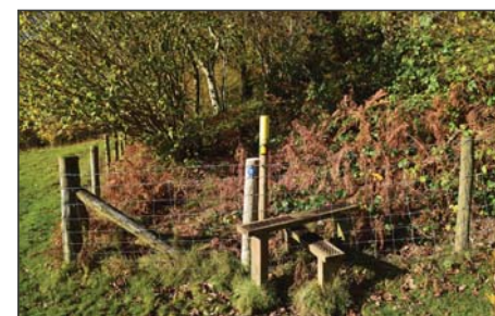
Yellow painted waymarker post and stile into woodland