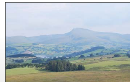
View of the Aran mountain from the summit of Moel y Garnedd

Despite being only 1,181ft above sea level the views from here are stunning. The surrounding mountains – Arenig, Aran, Cader Idris and Berwyn Mountain ranges – are all between 2,700 and 2,900 feet high. They were formed some 500 million years ago – the lower hills formed under the sea, the higher ones formed by volcanic action.