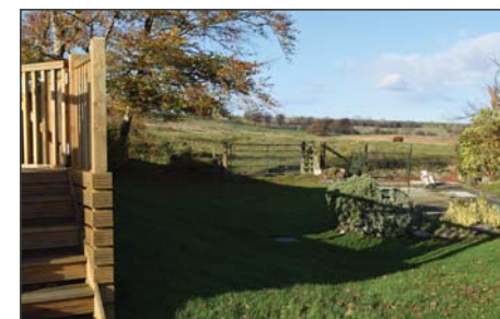
The gate out of the caravan park leading to the heathland of Gwastadros and the summit of Moel y Garnedd