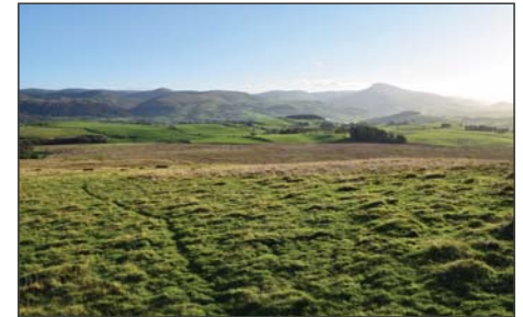
The sheep track that indicates the way from the summit of Moel y Garnedd.

This heathland may be very boggy so take great care especially after a period of prolonged rainfall.