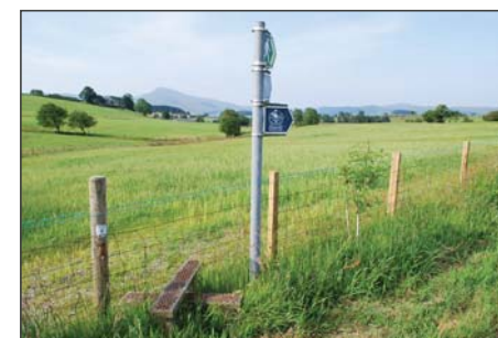
The roadside footpath sign showing the way towards Llwyn Mawr Uchaf farm