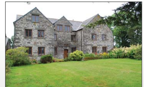
Caer Gai historic farmhouse

The history connected to this site goes way back before Cromwell's time. Originally, this was the site of an old Roman fort – a Roman road goes right by it and the remains of a Roman cemetery and baths were discovered nearby.