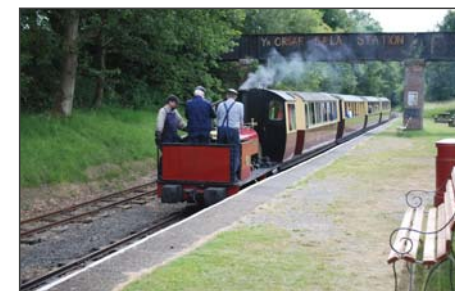
Bala Lake Railway's Bala station