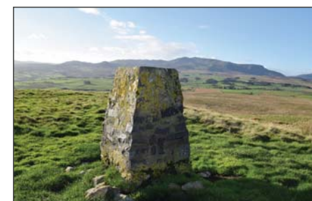
The Arenig mountains from the summit of Moel y Garnedd

There is also a bus service that runs between Bala and Llanuwchllyn throughout the year, but again it's best to check the timetable before you set off, otherwise it's another six miles of roadside walking back to Bala on top of the nine or so miles already walked!