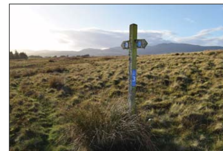
The isolated waymarker post in the middle of Gwastadros

Following the marker posts, skirt around to the left of the farm and continue beyond it to a field with glorious views of the hills and mountains to the west.