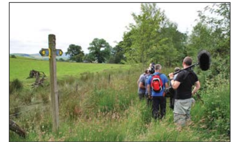
Turning off the vehicle track towards Caer Gai.

However, please note that this is not a public right of way and the farmhouse is a private home therefore permission to look at the house should be obtained beforehand.