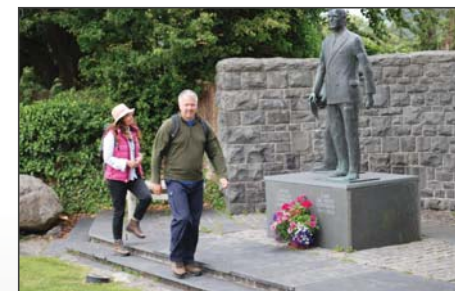
Sir O.M. Edwards and Sir Ifan ab Owen Edwards memorial

Today there are about 50,000 Welsh children and young people who are members of the Urdd , which has 10,000 volunteers who are active in 900 branches throughout Wales.