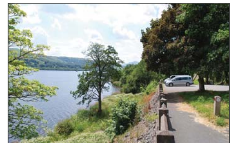
Views of the lake from the path beside the main road

Leave the car park through the main entrance and turn left onto the footpath beside the main road. There are lovely views of the lake on your left hand side.