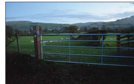
Roadside gate leading to the path through fields and on to Llanuwchllyn

Taking great care and facing oncoming traffic, walk over the bridge then cross over onto the pavement which leads to the village of Llanuwchllyn where you will soon reach the memorial to Sir O.M. Edwards and Sir Ifan ab Owen Edwards on the left hand side.