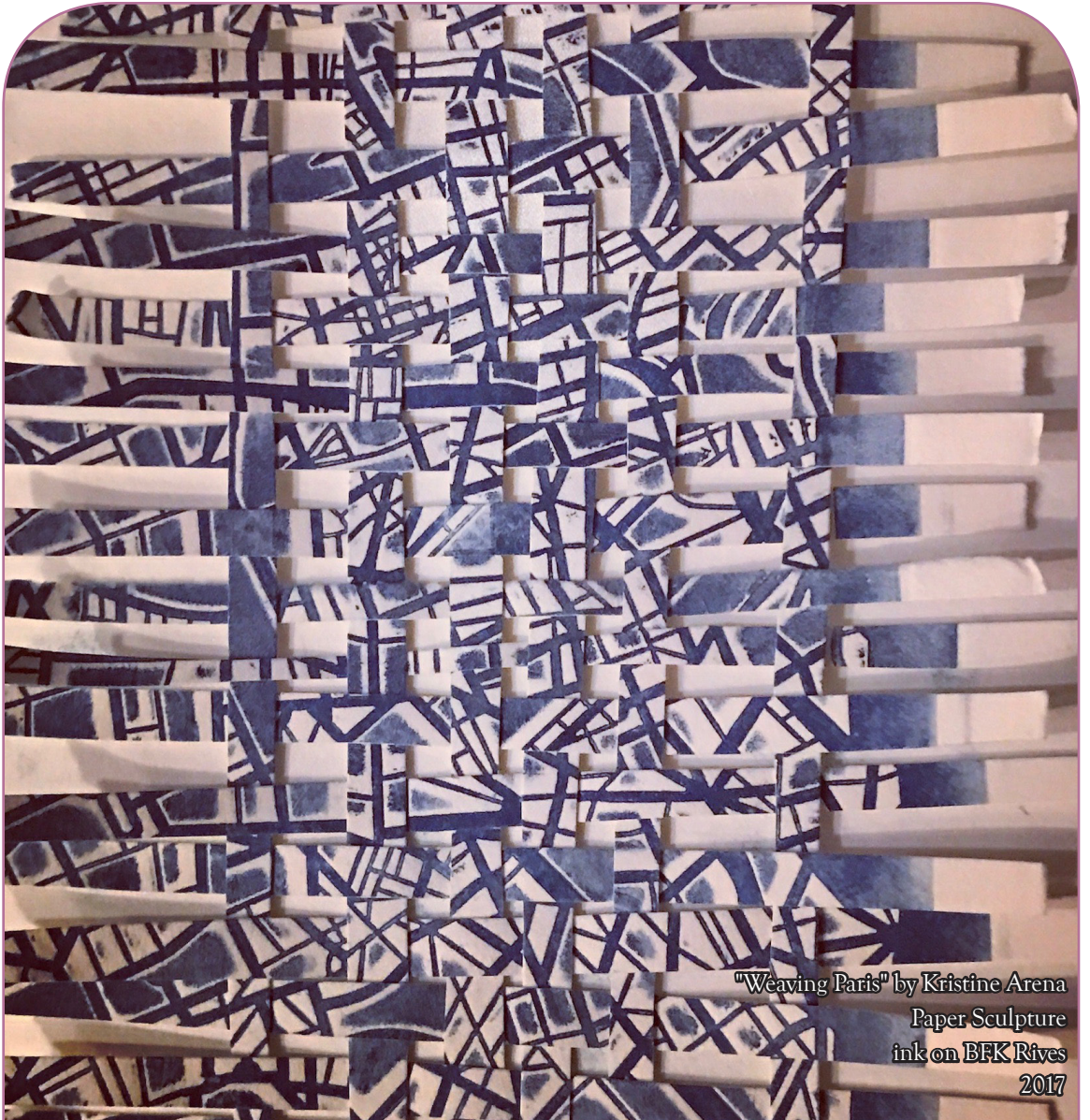
"Weaving Paris" by Kristine Arena Paper Sculpture ink on BFK Rives 2017