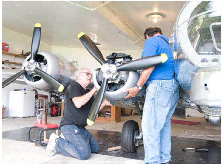
Working on the cowling.