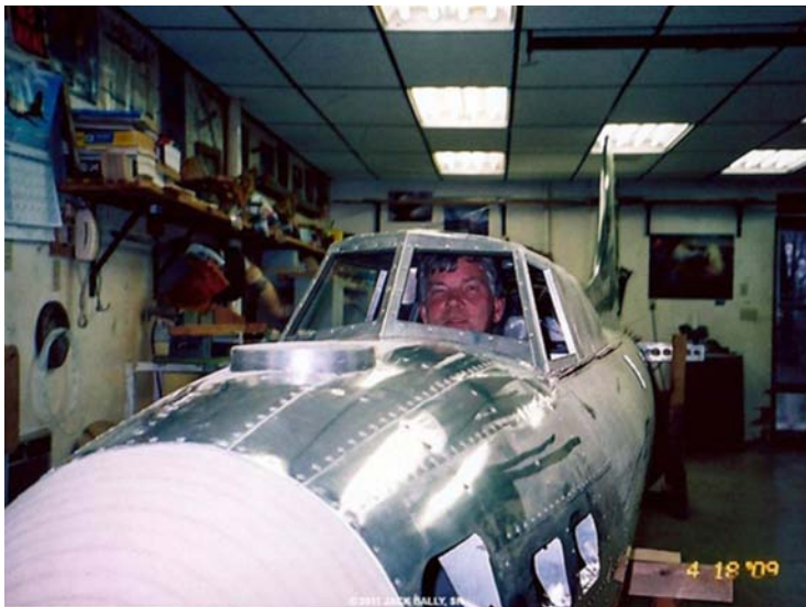
There is a giant in the cockpit!!