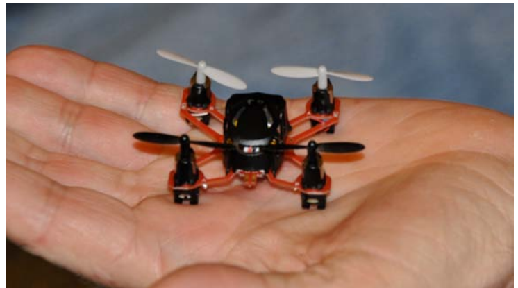
That's the Proto on a normal sized hand!

Matt Abrams showed a new RTV photographic glider designed for a go-pro camera. It's relatively big in white foam and has a five to ten mile radius. It's a $295.00 item from Range Video.Com. Matt is totally into aerial videography.