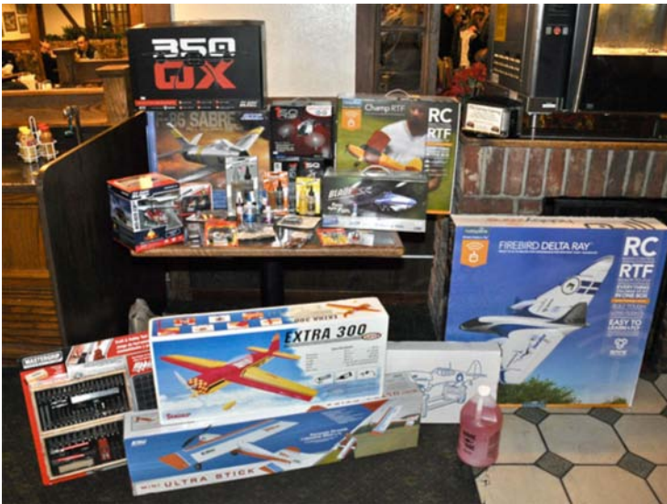
The prizes, from J&M Hobby House.