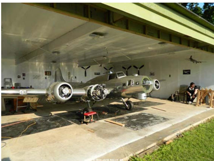
The B-17 in it's hangar.