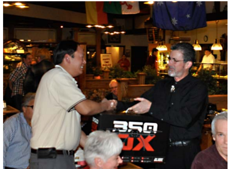
Lew won the Grand prize of the 350 QX Quad