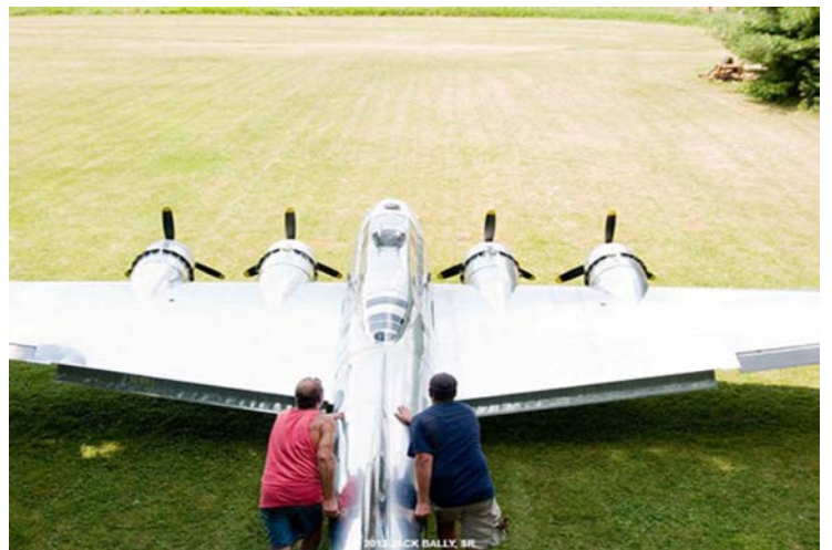
Pushing out for a photo session.