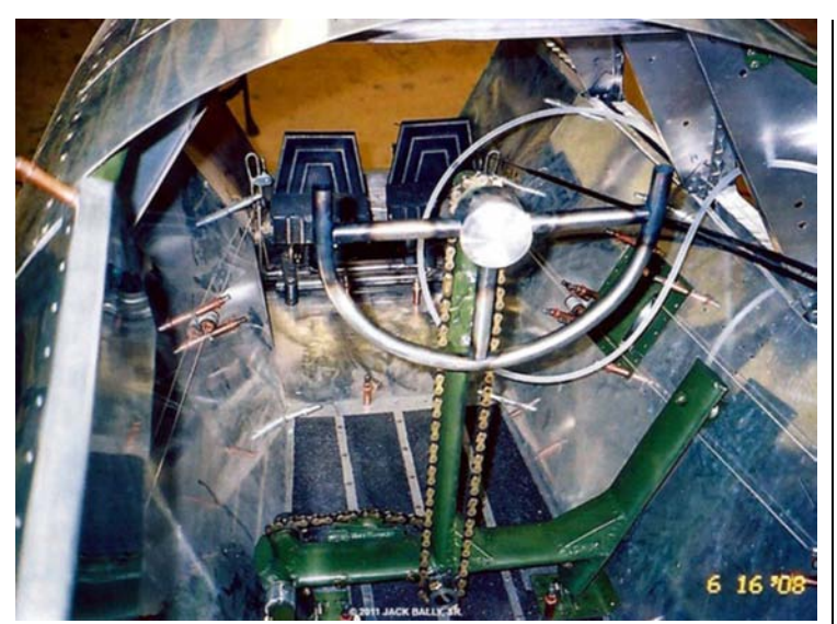
The front office aka cockpit of the B-17!