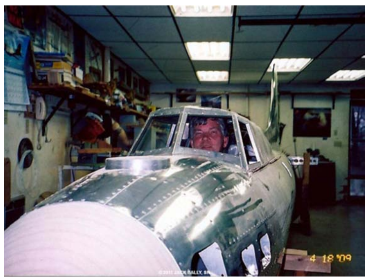
There is a giant in the cockpit!!