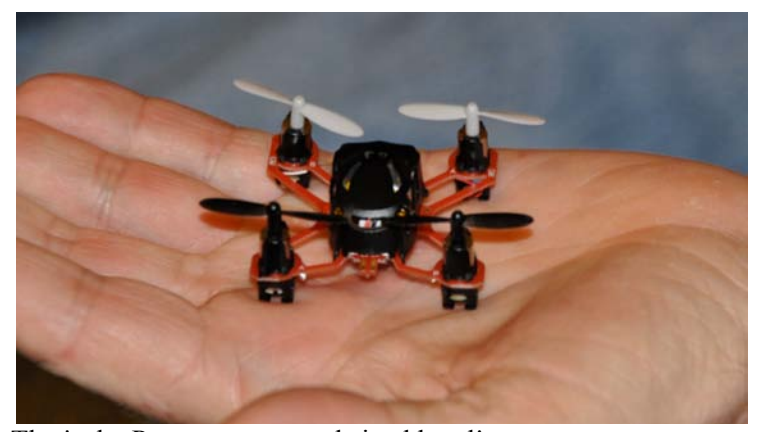
That's the Proto on a normal sized hand!

Matt Abrams showed a new RTV photographic glider designed for a go-pro camera. It's relatively big in white foam and has a five to ten mile radius. It's a $295.00 item from Range Video.Com. Matt is totally into aerial videography.