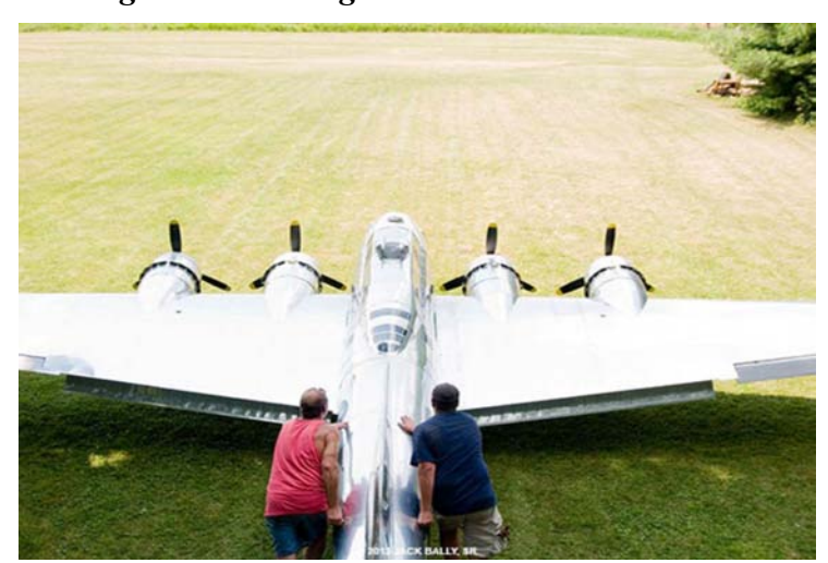
Pushing out for a photo session.