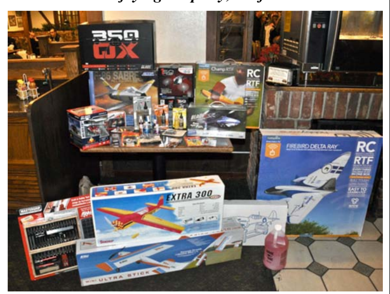
The prizes, from J&M Hobby House.