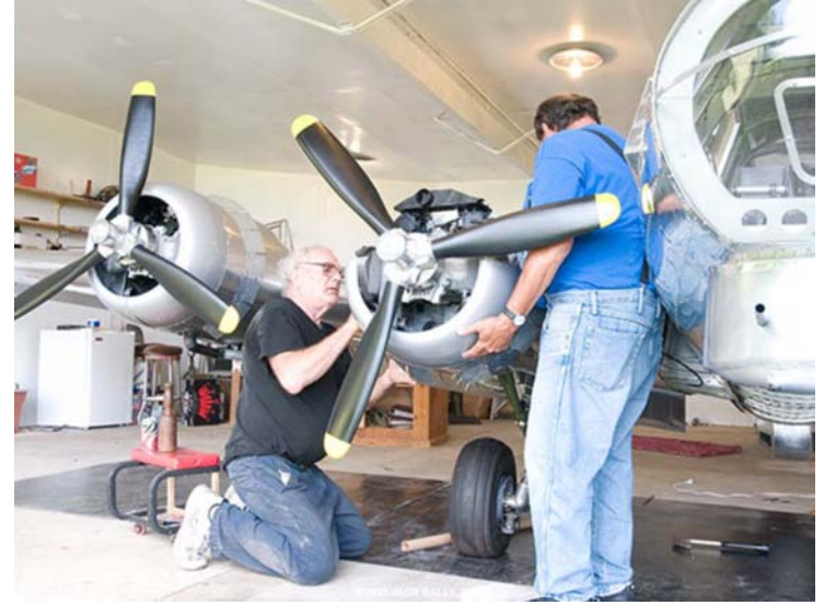
Working on the cowling.