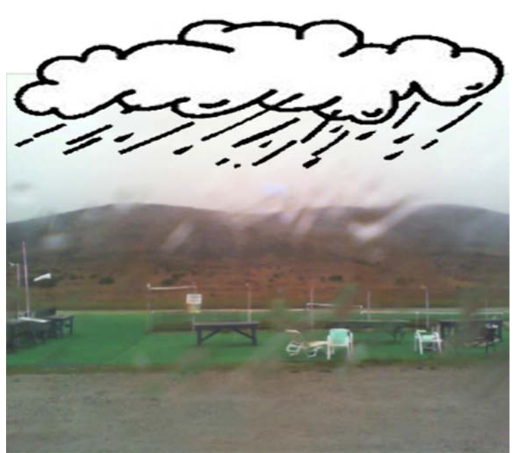
The rain is finally here!! It's the perfect building weekend! Break out the floatplanes!