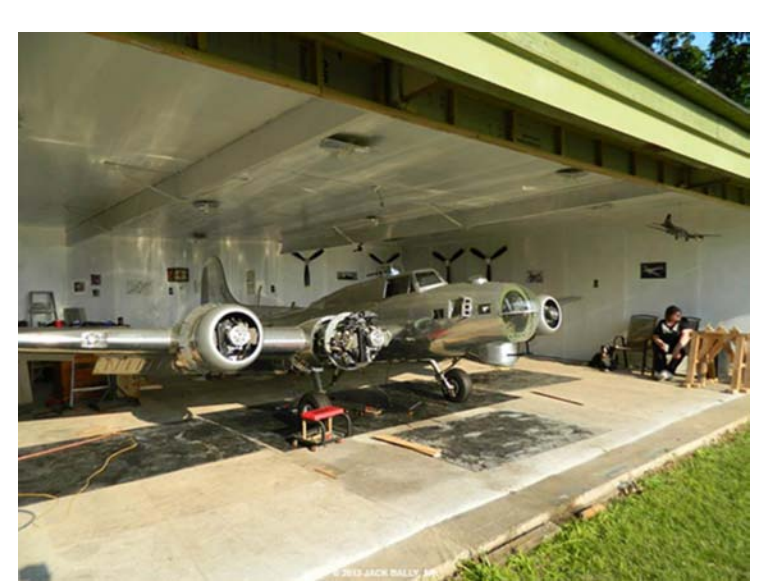
The B-17 in it's hangar.