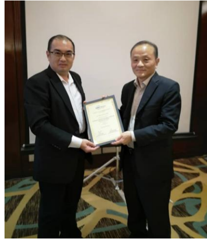
LEFT : PRESIDENT NG WEN BIN ; RIGHT : IR TL CHEN