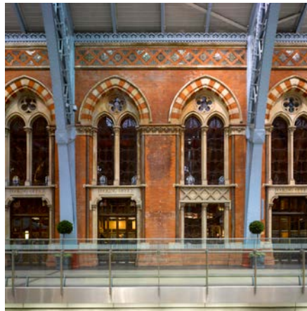
The Booking Office