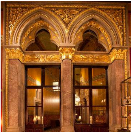
The Gilbert Scott Restaurant Entrance