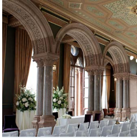
The Ladies Smoking Room Pillars