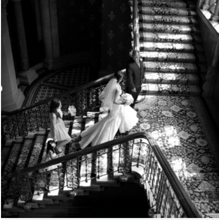
The Grand Staircase