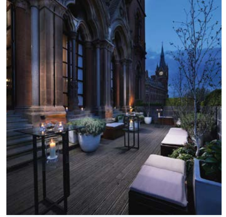
The Ladies Smoking Room Terrace