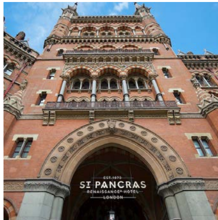
Hotel Main Entrance