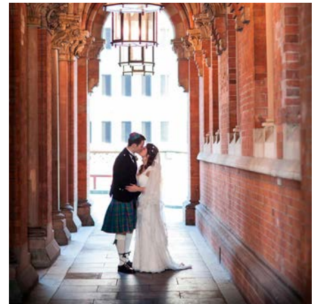
Hotel Forecourt Archways