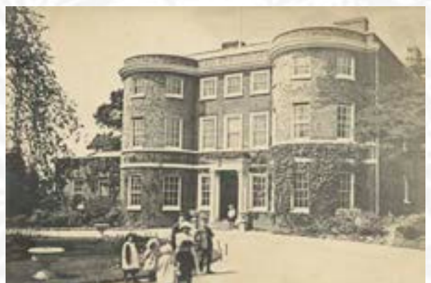
Water House in 1914