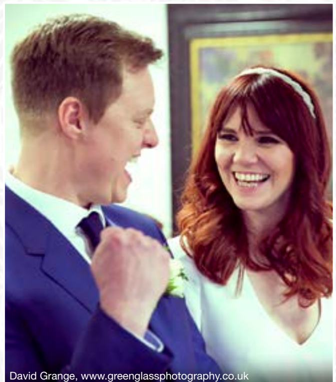
David Grange, www.greenglassphotography.co.uk