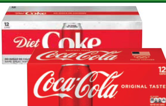
Coca-Cola Can Spectacular Assorted Varieties 12 pk., 12 oz. cans