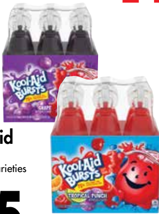
Kool-Aid Bursts Assorted Varieties 6 pk.