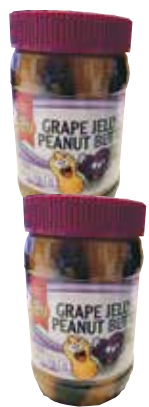
Piggly Wiggly Grape Jelly & Peanut Butter 18 oz.