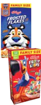
Kellogg's or General Mills Family Size Cereal Froot Loops, Honey Nut Cheerios, Frosted Flakes or Raisin Bran 19 - 24 oz.