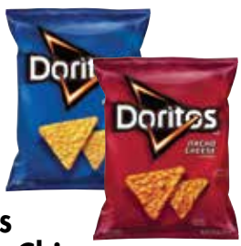
Doritos Tortilla Chips Assorted Varieties 9 oz.