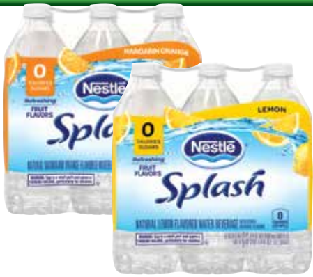
Nestlé Splash Flavored Water 6 pk., 16.9 oz. btl.