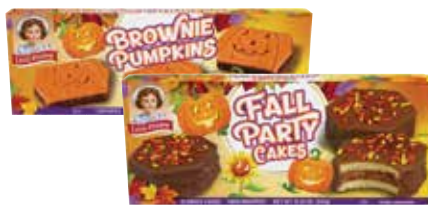
Little Debbie Fall Party Cakes Assorted Varieties 9 - 12 oz.