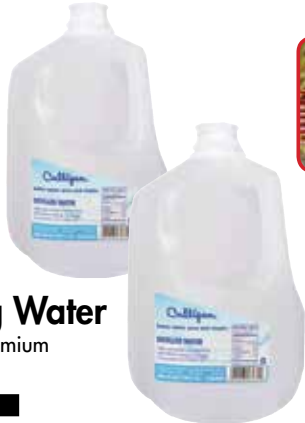
Culligan Drinking Water Purified or Premium gallon jug