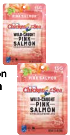
Chicken of the Sea Pink Salmon with Lemon Pepper 2.5 oz. pouch