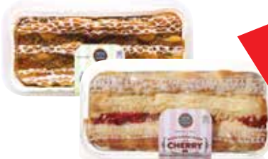
Table Talk Blueberry Pie 8-inch $4.99