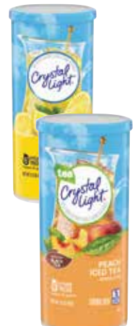
Crystal Light Water Flavoring Packets Select Varieties 6 - 10 ct.