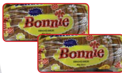
Bonnie White Bread 16 oz. loaf