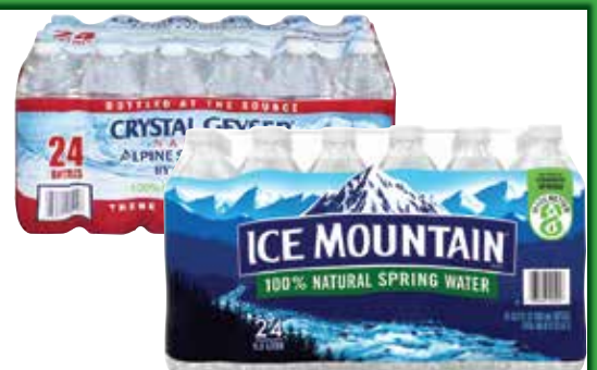
Ice Mountain or Crystal Geyser Spring Water 24 pk., 16.9 oz. btl.