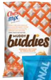
Chex Mix Cheddar, Traditional or Muddy Buddies 10 - 15 oz.