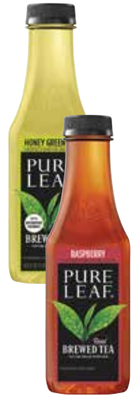
Pure Leaf Real Brewed Tea Assorted Varieties 18.5 oz.