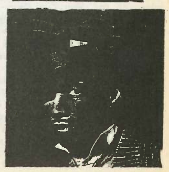
KING CREOLE & COCONUTS 1, Too Have Seen The Woods Sire - 92-55794-P