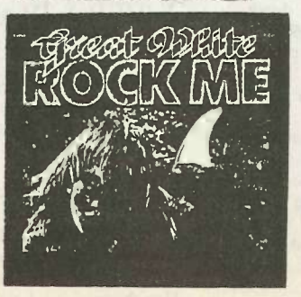
ROCK ME Great White Capitol - B-44042-F