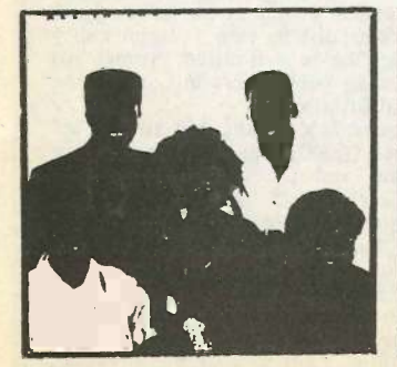
ALWAYS Atlantic Starr Warner Bros - 92-84557-P