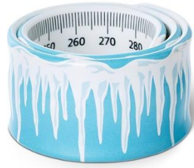
Icicle slap band Ruler

The Scented Stackable Highlighters and Snowy Origami Set from Term 1 are also still available.