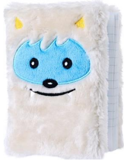
Yeti Fluffy Notebook

Exciting new Term 2 Polar Savers rewards are now available, while stocks last!