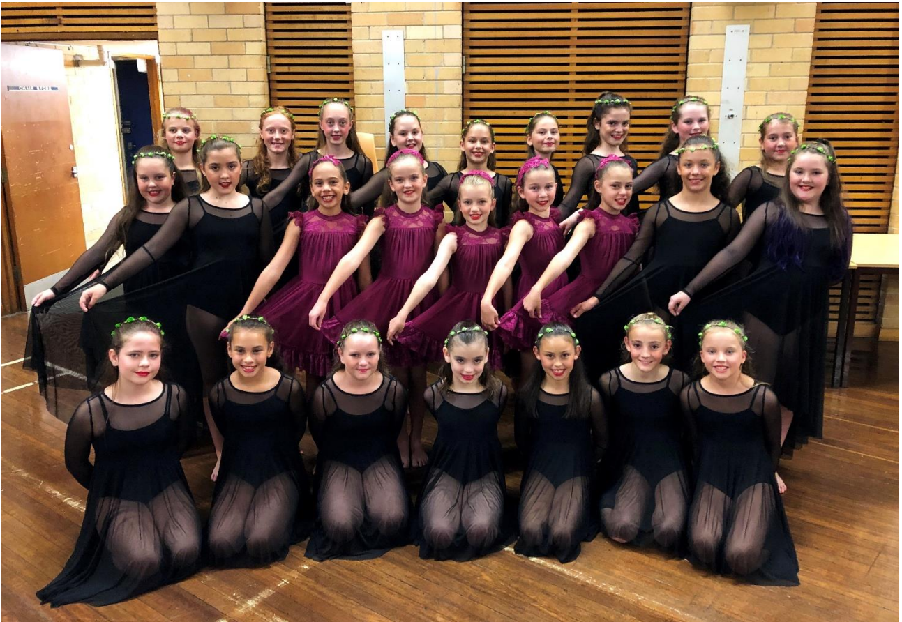
Winners! Stage 3 Dance Group