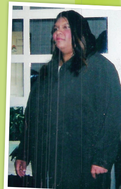
THEN: 350 lbs