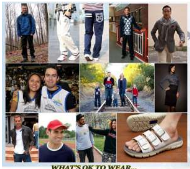
WHAT'S OK TO WEAR...

* Display of tattoos, body art and brands that are prejudicial to good order, discipline and morale or are of a nature to bring discredit upon the U.S. Navy is prohibited. * Earrings for men and women that are neat, clean and in good taste are authorized. Active duty men, earrings are discouraged, although they may be worn off base, in a non-duty status. * Body Piercing for any individual subject to this instruction that appears excessive and brings into attention or makes the individual a spectacle is prohibited. It is not authorized for active duty personnel in civilian attire, when in duty status, or while aboard any ship. * Outrageous hair styling or coloring is unauthorized, and must comply with the hair/grooming standards.