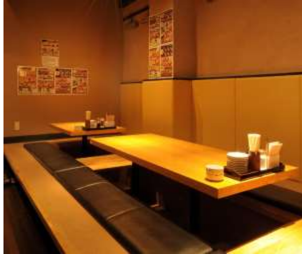
Restaurant with traditional low tables

In Japan, some restaurants and private houses are equipped with low Japanese style tables and cushions on the floor, rather than with Western Style chairs and tables.