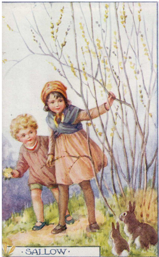
Margaret Tarrant - Vintage Illustrations – Children's Books

There will be no more afterservice Coffee via Zoom.